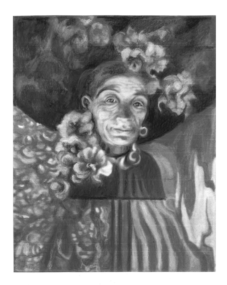
A message from the Ancient future past Whispers in our ears..... Once Upon a Time is NOW, Honor Earth as, "Gelf".