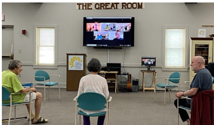
Hybrid classes allow remote participants to join via Zoom while the class gathers in the Great Room