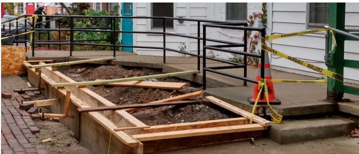
The new patio taking shape in October, 2022

2022 was a year of growth at Yellow Springs Senior Center. We gained new members, emerged from COVID restrictions, and created a new gathering space – our very own patio. This is the first expansion of the Center since the Great Room was built in 1994. There have been many transitions in the 63 years of our growth, including some ingenious fundraising projects. Did you know that in our early years volunteers ran a thrift shop, bakery and flour mill in the building that is now the Emporium?