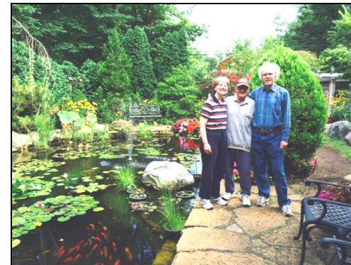
Garden Party welcome at the Welton's

A Planned-Giving brochure was designed late in 2014 (made available in 2015). There were 2 legacy gifts (gifts designated through planning to the Senior Center) that totaled $22,500.