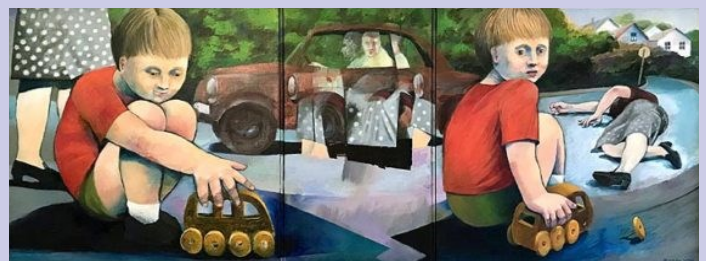
"Trauma Reshaped" triptych which appeared on the cover of the American Psychologist magazine.