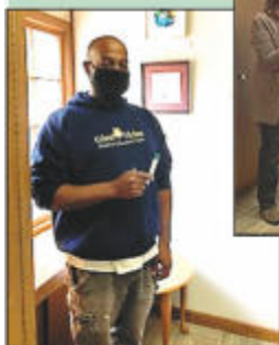
Staff & volunteers Covid testing.